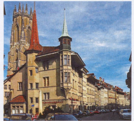
The old city of Fribourg with St Nicholas cathedral

through the town, is the local defining line of the Röstigraben: Fribourg is split roughly 70:30 between French speakers, who are a majority on the western bank; and Swiss-German speakers, who form a majority on the eastern bank. The town's radio station has two separate channels, many streets have two names, and almost everyone is instinctively bilingual. Some of Fribourg's older folk even cling on to the ancient Bolze dialect, a mixture, unsurprisingly, of French and German which you might be able to catch in the taverns and public squares of the Basse-Ville (Lower Town): in Bolze, the town is Frybürg, and you'll hear people calling each other Ggopäingj ("friend").