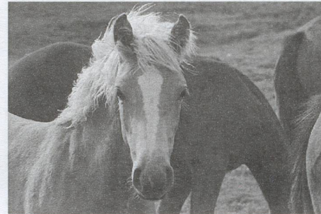
Horses roaming in the Jura

separatist slogan "Jura libre" speak of the turbulent and politically active recent past.