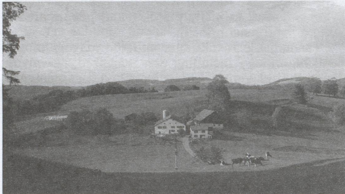
Farmhouse in the Jura

Ignored by most travellers, but well loved by the Swiss themselves, Canton Jura, in the far northwest corner of the country, is a rural gem, perfect if all you want from your holiday is to walk or cycle your way through gentle, rolling countryside and dark, fragrant forests, with only the smallest of villages and simplest of hotels (or campsites) to provide material comforts.