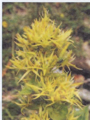
Great Yellow Gentian

Gentiana lutea (Great Yellow Gentian) is a species of gentian native to the mountain of central and southern Europe. Other names include 'Yellow Gentian', 'Bitter Root', 'Bitterwort', 'Centiyane', and 'Genciana'. It is a herbaceous perennial plant, growing to 1-2 m tall, with broad to elliptic leaves 10-30 cm long and 4-12 cm broad. The flowers are yellow. It grows in grassy alpine and sub-alpine pastures, usually on calcareous soils.