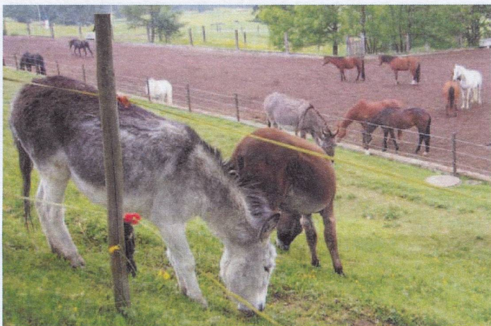
Retirement home for horses and donkeys at Le Roselet

The Foundation for the Horse is a refuge for horses, ponies and donkeys. Some 170 animals live in the foundation's three "homes" in Le Roselet, Jeanbrenin and Maison Rouge. They live out their days in the meadows of the Jura mountains.