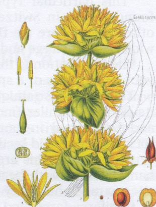
Flowerhead and seed