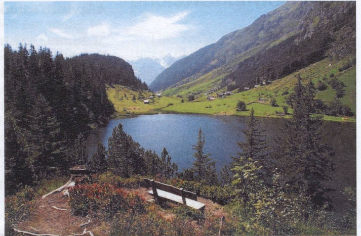
Golzerensee and the beautiful Maderanertal

This east-west running side valley of the Reuss valley is another quite famous mineral location in Switzerland. The name of the Maderaner valley goes back to a noble family who mined in the 16th and 17th centuries the iron ores at the Windgällen locality. After the Madran family diminished in 1631, the mining came to an end. In the 19th century, some wanted to start it again but the people of Silenen prohibited the use of wood out of the forest, a quite remarkable move at that time.