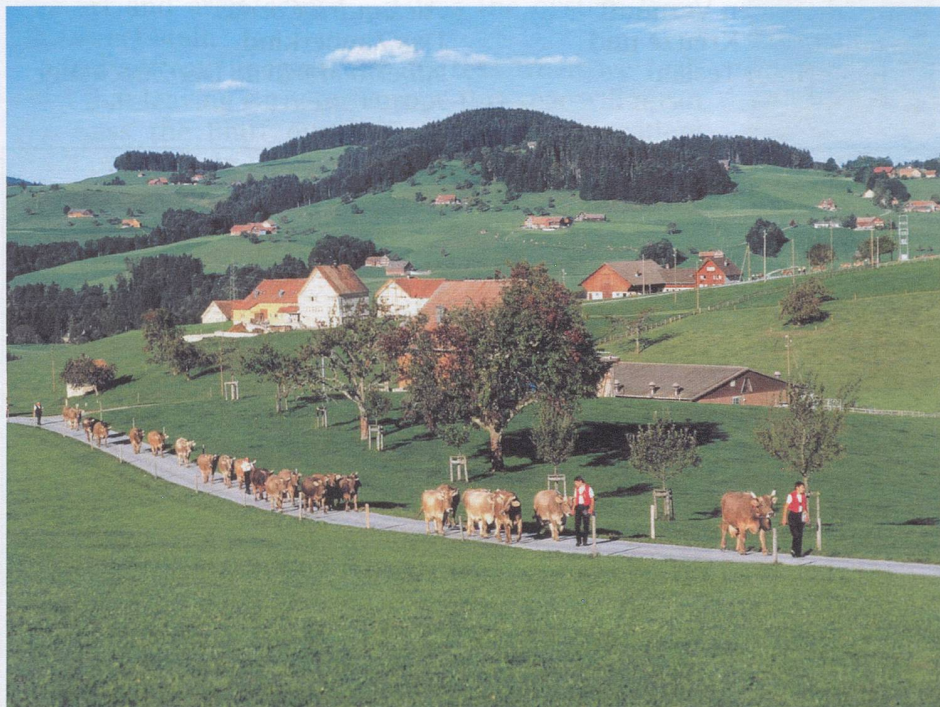
Pastoral landscape of Appenzell Innerrhoden

The name Appenzell means "cell (i.e. estate) of the abbot". This refers to the Abbey of St. Gall, which exerted a great influence on the area. By the middle of the 11th century the abbots of St Gall had established their power in the land later called Appenzell, which, too, became thoroughly germanized; its earlier inhabitants were probably romanized Raetians.