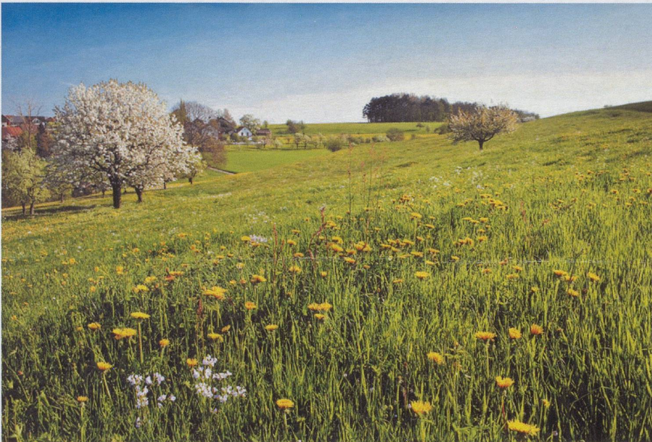
Tafeljura near Anwil

Basel-Landschaft, together with Basel-Stadt, formed the historic Canton of Basel until they separated following an uprising in 1833.