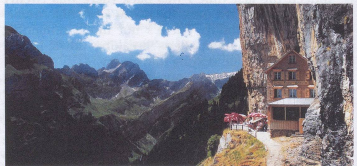
Berggasthaus Aescher - Wildkirchli

Death during hibernation was a common end for cave bears, mainly befalling specimens that failed ecologically during the summer season through inexperience, sickness or old age. Some cave bear bones show signs of numerous different ailments, including fusion of the spine, bone tumours, cavities, tooth resorption, osteomyelitis, rickets and kidney stones. Paleontologists doubt adult cave bears had any natural predators, save for pack hunting wolves and cave hyenas which would probably have attacked sick or infirm specimens.