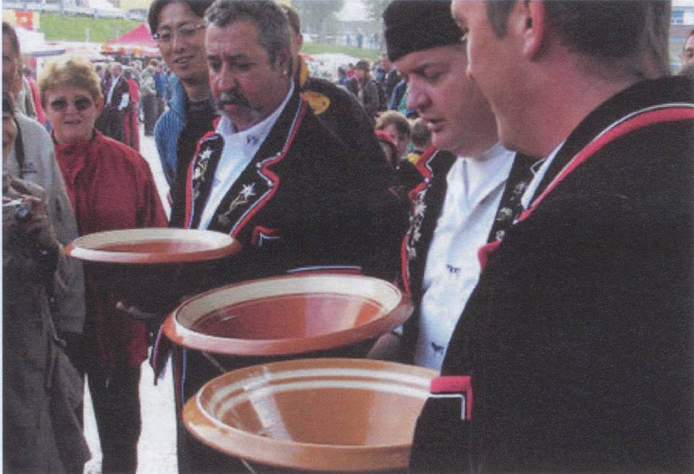
Talerschwingen is a serious affair

Talerschwingen became popular in Appenzell and Toggenburg about 100 years ago. Thereby a five-franc piece is rolled around the inside of an earthenware bowl, which is held on the palm of one hand and slowly rotated. Three bowls of different diameter, used simultaneously, produce a sound reminiscent of distant cowbells, which harmonises well with yodeling.