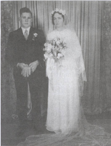
Bride and groom