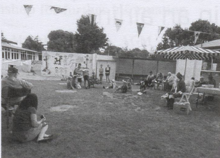
Santa comes to watch the pantomime before he hands out the presents.