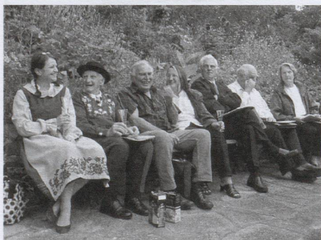
Warming up (with schnapps) while waiting to sing

Sunday, 12 th December: Carol Singing. We'd also had a fine time singing old favourite carols