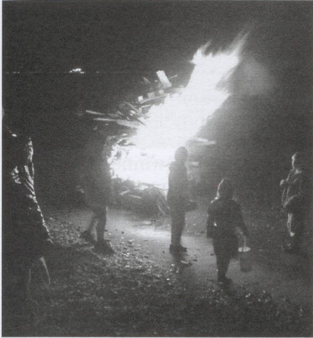
The big fire on Petone Beach

for the children so they were able to roast marshmallows. Many had brought their lanterns. Someone had the great idea to bring sparklers, which was a big success with the younger members.