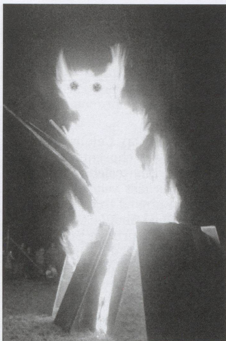
6m tall Firedragon

Pub night Friday 05 August - The August issue of the pub night took place in the Union Post Brewbar in Ellerslie, a venue we hadn't been before. As so often on pub nights we were happy to see some new faces around. The fact that the venue was quite crowded showed us that we are not the only ones to appreciate a