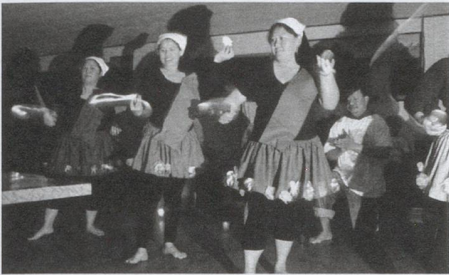
... and a Philipino performance