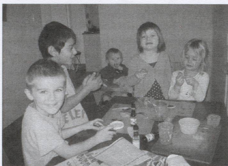
Eating our artwork

20 th July – We had one of our (almost) regular “ Krabbelgruppe ” (understand “coffee group”) on Wednesday 20th July. We were four mums and 9 kids, ages ranging from five months to six years.