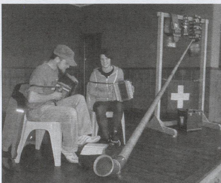
Our young musicians

Again we chose to have our National Day celebration on a Sunday as last year's lunch-time function proved to be very popu- lar. We had about 100 members and friends turn up promptly at the Matangi Hall and after a brief welcome by the president everyone was ready to queue up for their buffet lunch. We had copious supplies of sauerkraut, potatoes, speck, ham and two types of sausages. No one went hungry and most people had a chance to come back for sec- onds. There were lots of com-