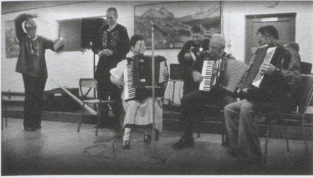
Our home-grown entertainment...