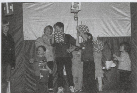
Weiss nicht, ob das von Auckland ist.

feel real with their Lampion - Parade, and their parents who got them all organised.