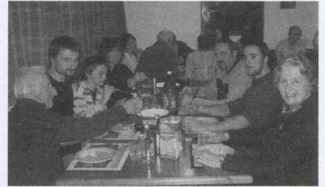
The main medal winners...