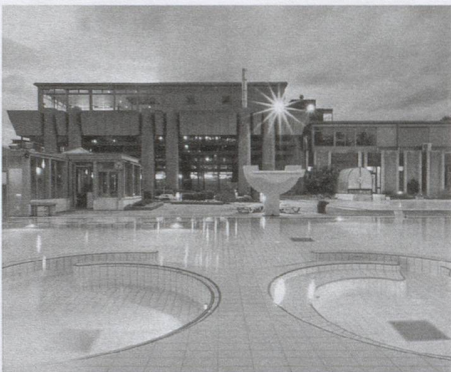
Thermal Centre at Yverdon-les-Bains

The springs were probably known and used even before the Roman era, at the time of the Helvetii, when the springs were a sacred place. Documents from the Middle Ages prove the existence of a spa centre as early as 1429, and mention several buildings.