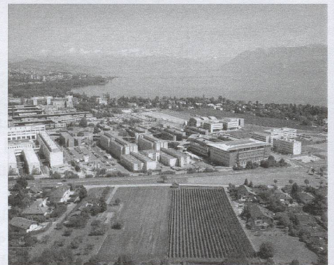
Ecole Polytechnique Fédérale

The Ecole Polytechnique Fédérale de Lausanne (EPFL) is one of the two prestigious Swiss Federal Institutes of Technology. From its foundation in 1853, EPFL has evolved into a strategic centre of innovation in Switzerland and an internationally recognized institution. Nowadays, it regularly ranks among the best universities in Europe and in the world in academic rankings. Over the years, EPFL has become increasingly international, recruiting the best students and outstanding faculty worldwide. With 112 nationalities on campus, 50% of its faculty and 60% of its PhD students from abroad, no wonder EPFL has been ranked one of the most international campuses by the Times of Higher Education Supplement.