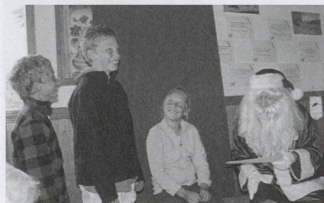
They must be exceptionally good children - all smiles!