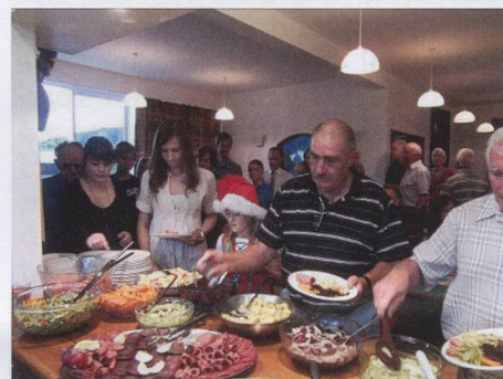
People queuing up for Christmas dinner