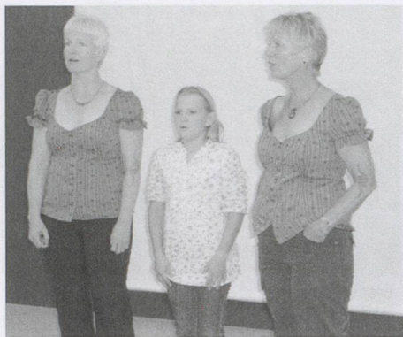
Like mother like daughter