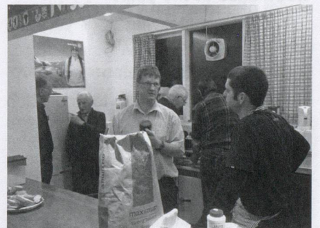
Men in the kitchen