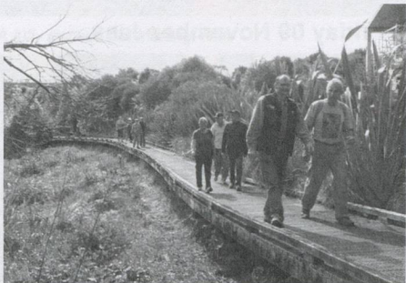
Hamilton Club enjoying its Chartwell Walk