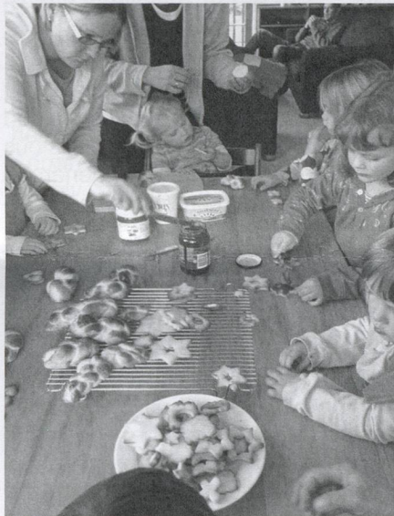
Making Zöpfe and Gutzli