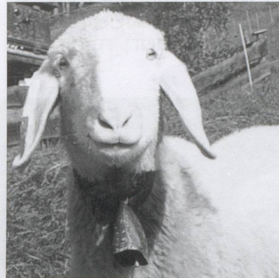
Swiss sheep may soon be sporting a new anti-wolf collar around their necks alongside a traditional bell

Alpine wolves may soon be running scared from Swiss mountain sheep if a new high-tech protection collar manages to reach the production line.