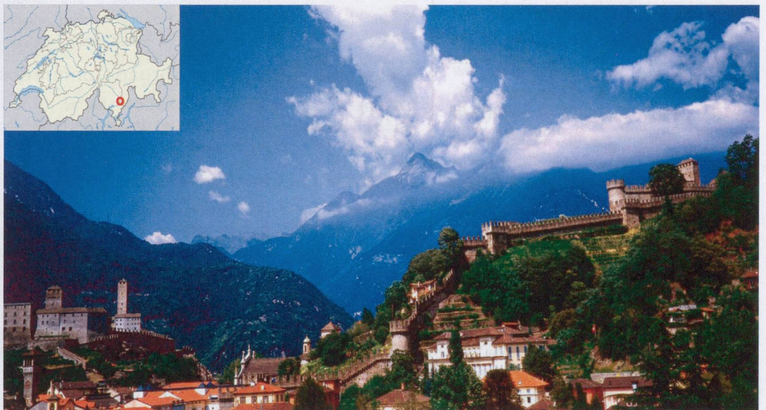
Bellinzona, with Castelgrande to the left and Montebello Castle to the right