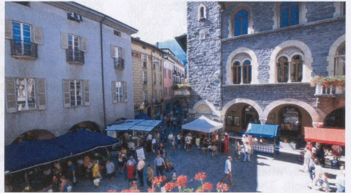
Piazza Nosetto