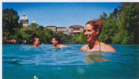
Aare River at the Marzili

One of us Marzili lifeguards was rostered on that shift and at the end of the shift, they would drop you off at the furthest point so you could get a long swim back to the Marzili and continue on your next shift.