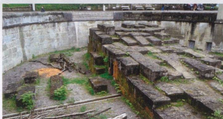
Alter Bärengraben