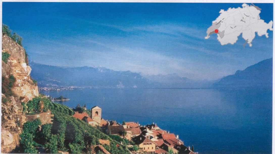
The village of Saint-Saphorin, with views over Lake Geneva towards the Bernese Alps in the east