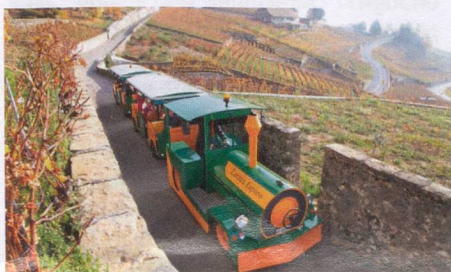
Lavaux Express