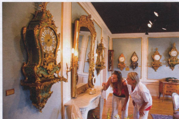
Watchmaking Museum Le Locle (Château des Monts)