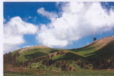
Mount Chasseral