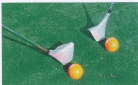
Swin golf clubs www.myswitzerland.com

http://www.neuchatel-tourisme.ch/en/leisure-activities/fun-co/