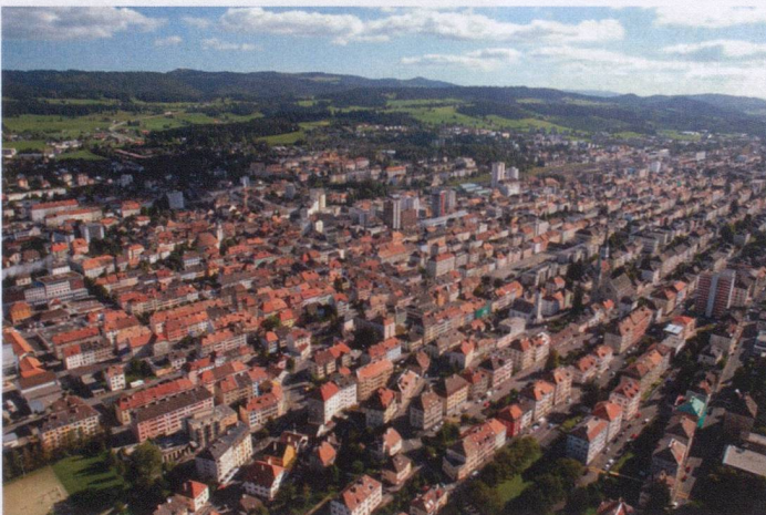
La Chaux-de-Fonds: Precision lay-out to meet the demands of industry