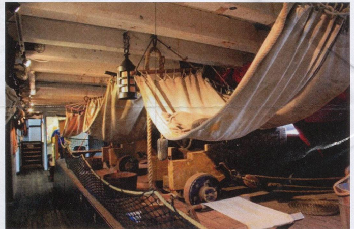
Sleeping quarters directly over the cannons!