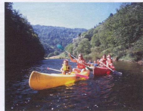
Kayaking on the Doubs River