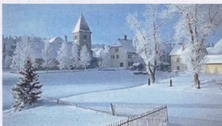
La Brévine, Neuchâtel Jura www.myswitzerland.com