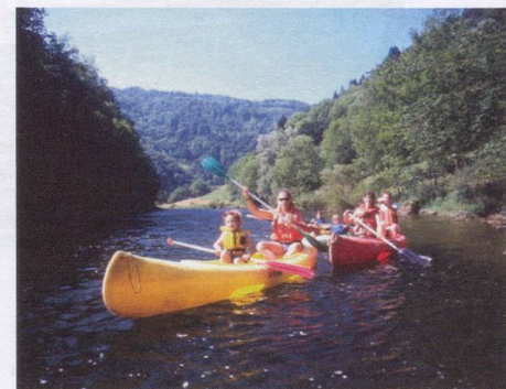
Kayaking on the Doubs River