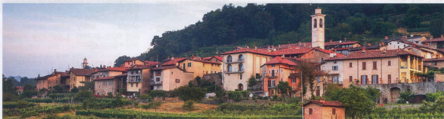
Picturesque Meride on Monte San Giorgio, a Swiss Heritage site of national importance