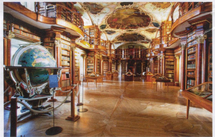
The famous Library (Stiftsbibliothek) of the Abbey of St Gall http://www.st.gallen-bodensee.ch/de/