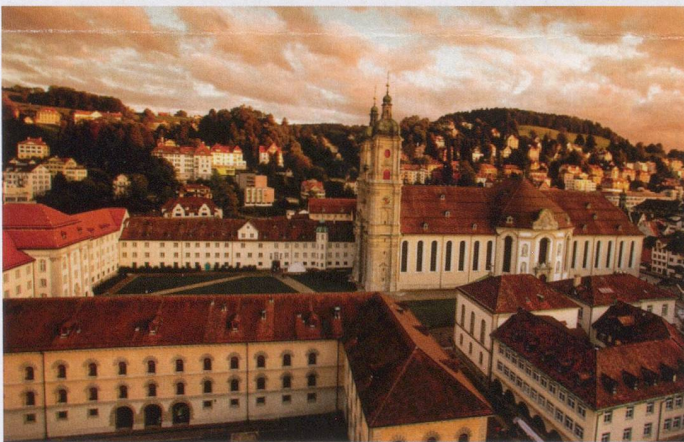
The Abbey of St Gall of today http://www.st.gallen-bodensee.ch/de/

http://en.wikipedia.org/wiki/Abbey_library_of_Saint_Gall , http://whc.unesco.org/en/list/268