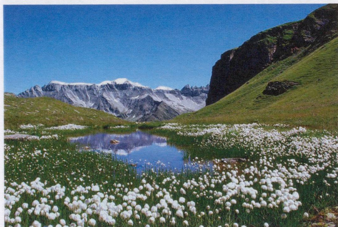
Lake Chüeboden above Elm, with views of Piz Sardona (3056m) and Tschingelhörner (2849 m)

www.glarusnord-tourismus.ch/region/region/articletype/articleview/articleid/126