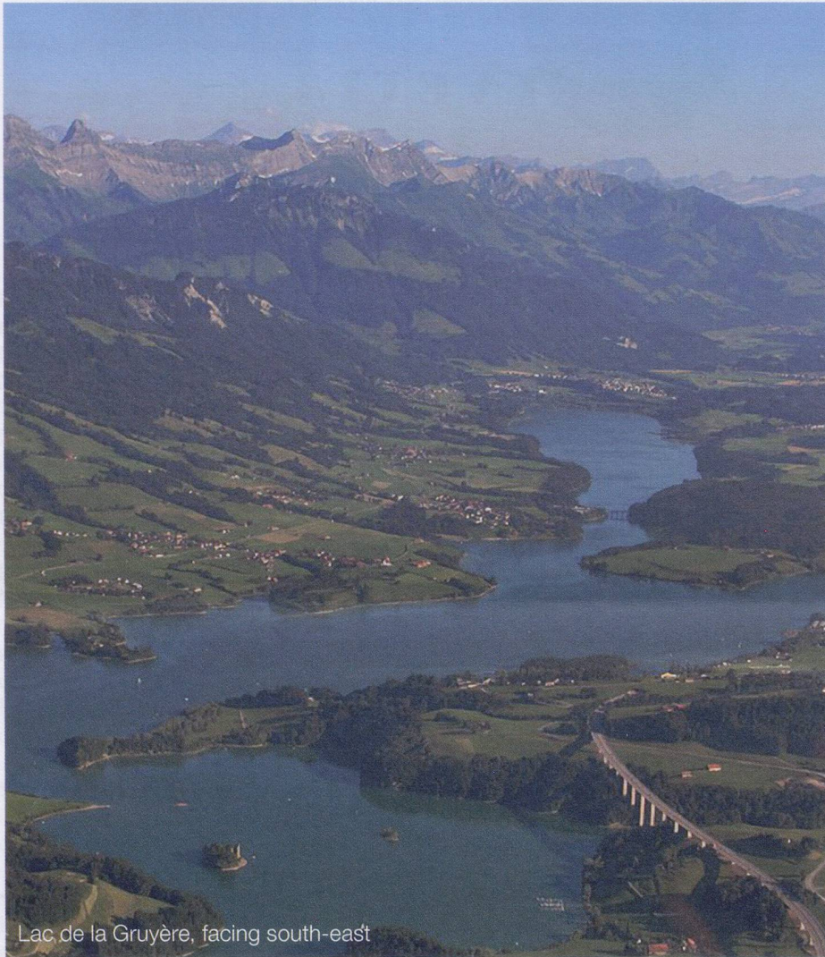
Lac de la Gruyère, facing south-east

The natural beauty and human history of the La Gruyère region, from the Lac de la Gruyère and its many tributaries, into the hills and pre-alps, offers plenty to experience for discovery and tramping.