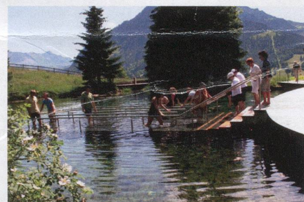
Kneippanlage Schwandalpweiher (Flühli)

Without the commitment of the local communities, the protection of an entire region as a biosphere of international