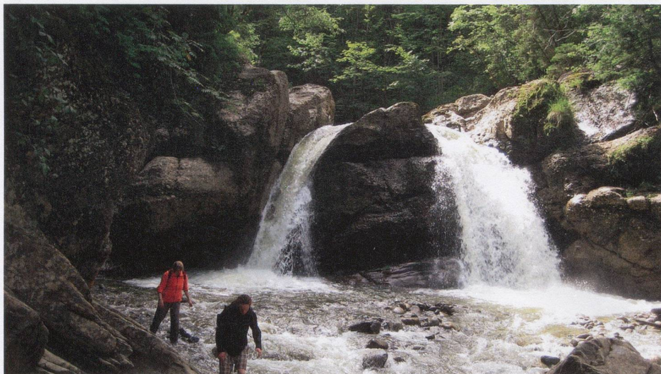
Hiking across the river landscape of the Grosse Entlen River

The Entlebuch has been re-zoned according to UNESCO requirements, creating a core zone where the conservation of nature is at the forefront, a buffer zone, where nature and human values are given equal importance, and the transition zone, where the life and main activities of the communities take place. Great efforts are also undertaken to re-connect existing bits of vegetation so that animals and plants are able to move and mix genetically.