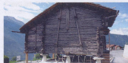
Mund Saffron Museum