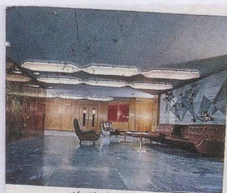
Vestibolo - Hall