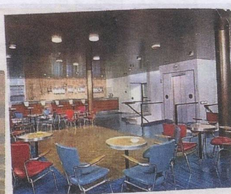
Veranda - Verandah