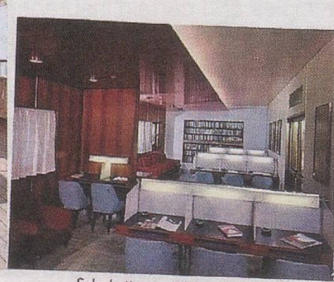
Sala Lettura - Writing Room