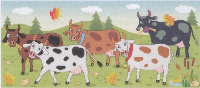
Spot 10 differences in the 2 pictures