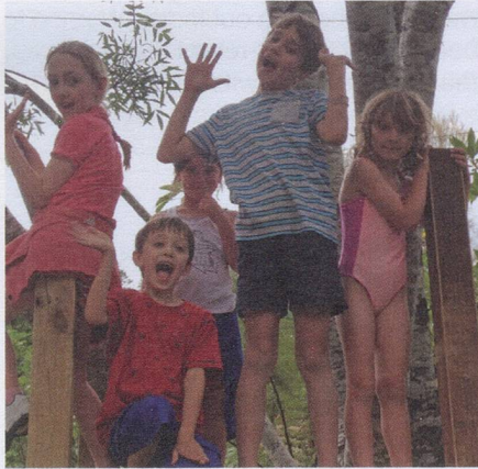
The kids are loving the flying fox