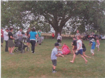
Kids at the picnic enjoying the lolly scramble