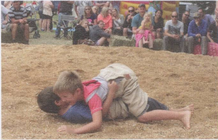
Two juniors doing battle ... looks like hard work