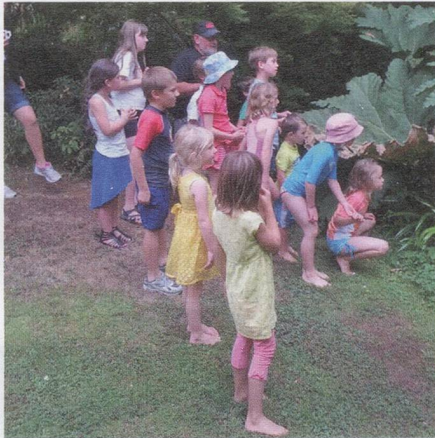
Looking for the witch in the bush