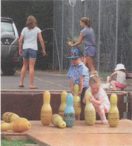
Next generation of bowlers