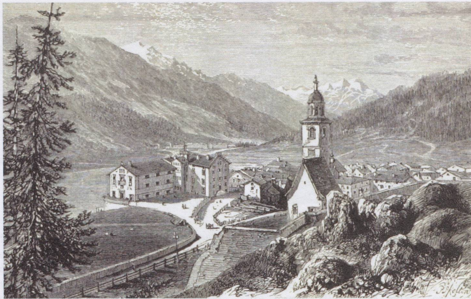
As it once was: St. Moritz and the Kulm Hotel in 1870

For a small and remote valley like the Engadin, a buzzing, touristy place like St. Moritz does come as a surprise. As recently as 1830, the village only had 200 inhabitants! It seemed like a little detective work was in order to find some of the reasons for this..