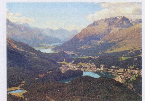
The lakes of the Upper Engadin and the town of St. Moritz