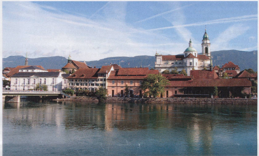
Solothurn viewed north from across the Aare River towards the Jura mountains, with the water front and Cathedral of St Ursus and Victor in the foreground.

Solothurn is a sleepy little provincial town on the Aare River, overshadowed by the Weissenstein Massif of the Jura Mountains. But don't underestimate this little backwater which packs a long and tumultuous history.