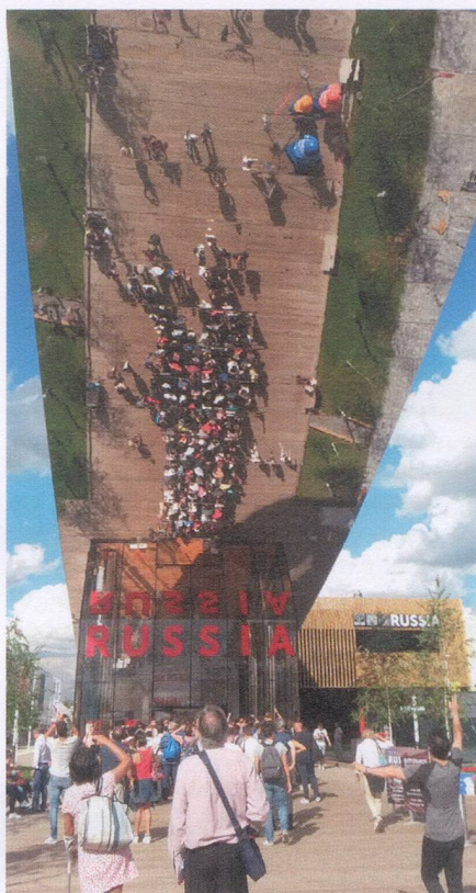
Russian Pavilion

At the end of the EXPO, the towers were dismantled and planned to be erected again as greenhouses in different Swiss cities. As such, the Swiss Pavilion served many different functions and made its point with information, and was therefore truly inspiring. SW