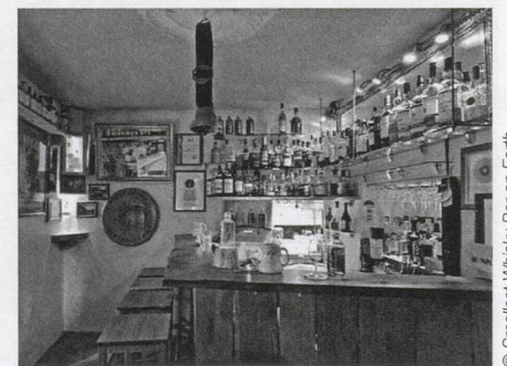
© Smallest Whisky Bar on Earth

Bonus: The Devil's Place whisky bar in nearby St. Moritz has been recognised by the Guinness Book of World Records for having the largest selection of whisky in the world, with 2,500 different kinds.