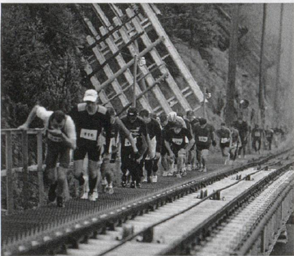
Climbers during the annual Niesen Stairway Run

The cruelest thing about this Swiss world record? The Niesen stairway is really intended for maintenance workers. The steps are built right beside the funicular tracks, essentially making the climb by foot pointless.