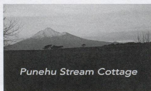
Punehu Stream Cottage