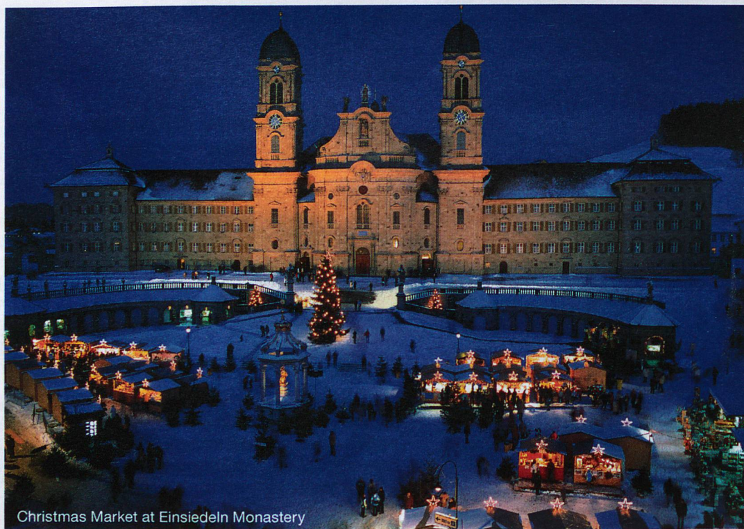
Christmas Market at Einsiedeln Monastery