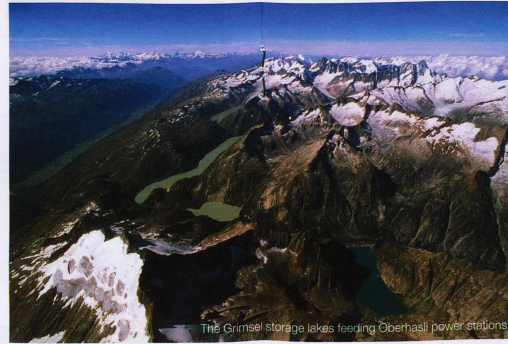
The Grimsel storage lakes feeding Oberhasli power stations

The uninitiated would certainly become hopelessly lost within this alpine labyrinth, with many parts only accessible on