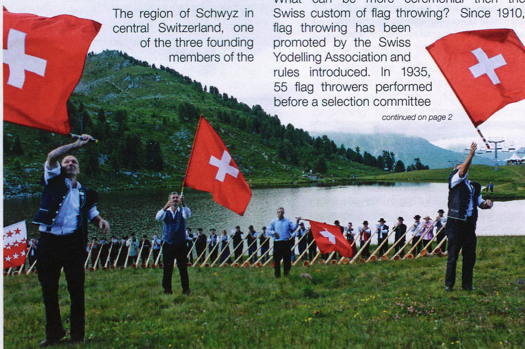
The region of Schwyz in central Switzerland, one of the three founding members of the

The larger the old confederacy became, the more they had a problem with inconsistently clothed troops that were hardly able to recognize their allies on the battlefield. In descriptions of the battle of Laupen (1339), white stripes forming crosses are mentioned for the first time as a joint recognition sign of confederate troops. The white stripes were fastened on the soldier's breast, back, shoulders, arms, leg, hats or weapons. In the middle of the 15th century, the white cross was integrated into the flags of the member states of the confederacy. Originally, the cross reached to the edge of the banner also in Switzerland, like in the Scandinavian flags.