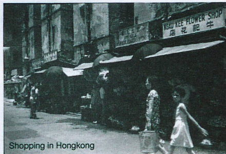
Shopping in Hongkong

Article compiled by Beatrice Leuenberger