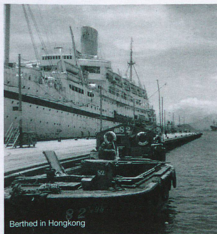
Berthed in Hongkong