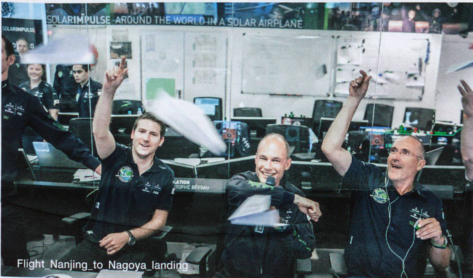
Flight Nanjing to Nagoya landing