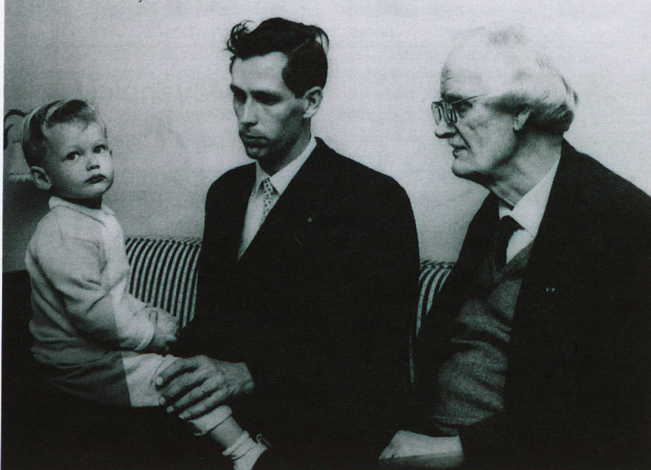
The Piccard Family

http://www.houseofswitzerland.org/swissstories/environment/bertrand-piccard-power-dreams-energy-tomorrow