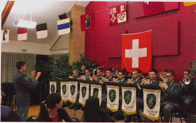
1st of August celebration in Auckland