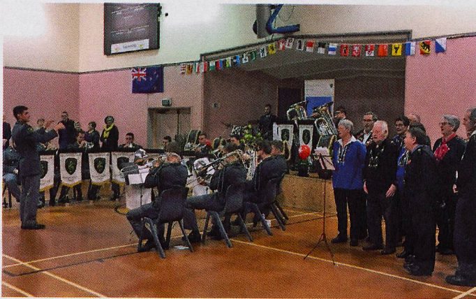
Performing in Taranaki