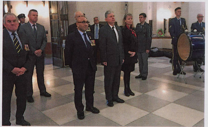
Last Post Ceremony at the National War Memorial together with the Minister of Defence, the Hon Ron Mark