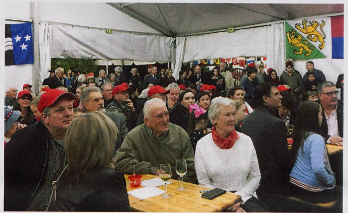
Big crowd at the residence on the 1st of August