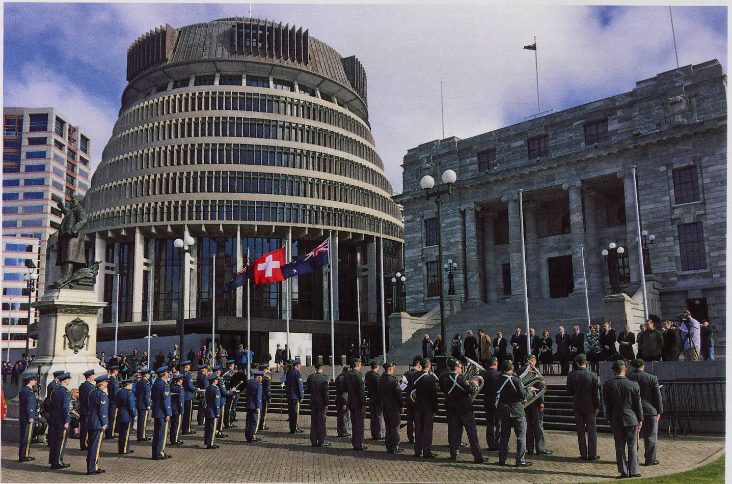
Joint performance with the New Zealand Air Force Band in front of parliament