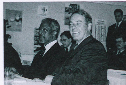
Federal councillor Adolf Ogi with Secretary-General of the United Nations, Kofi Annan

Based as it is in a neutral country, the Spiez lab has become a key partner for the UN, the United Nations Environment Programme (UNEP), the International Atomic Energy Agency (IAEA), the World Health Organization (WHO) and the International Committee of the Red Cross (ICRC). The importance of the lab's work can also be gauged by the fact that it is the trusted laboratory of three Nobel Prize winning organisations: - 1963: International Committee of the Red Cross (ICRC) - 2005: International Atomic Energy Agency (IAEA) - 2013: Organisation for the Prohibition of Chemical Weapons (OPCW)