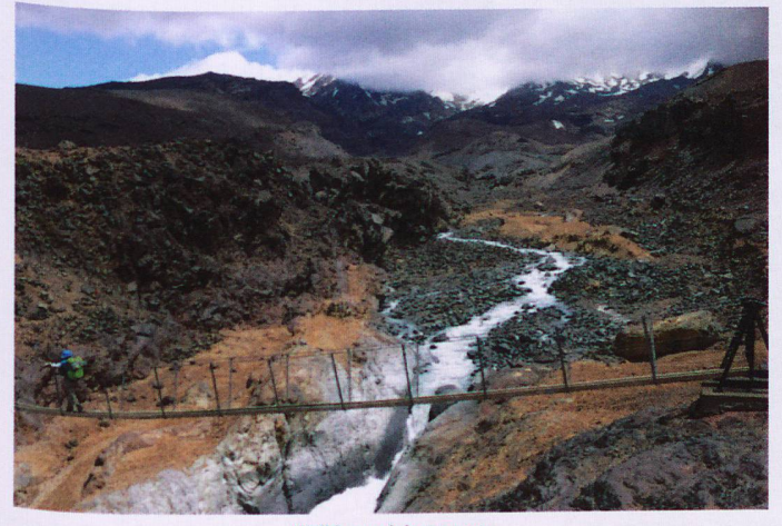
Waihianoa lahar gorge

https://www.doc.govt.nz/roundthemountain