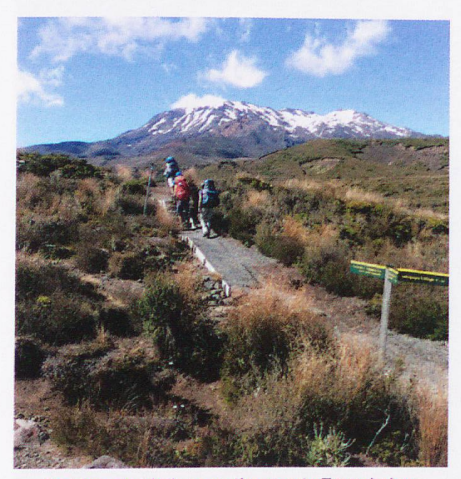
first hour behind us, on the way to Tama Lakes

We set off from Hamilton at 6am on Thursday 17th January, fuelling up with a good coffee from a cart in Taumaranui, left out intentions and car number at the Visitor Centre at Whakapapa Village and were on the track by 10am. The first day was via the top of the Taranaki Falls, the scenic Tama Lakes and the first