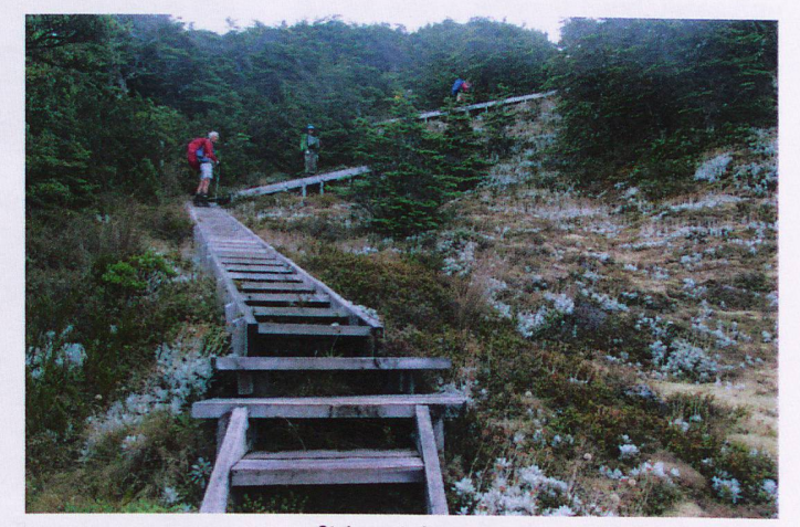
Stairway to heaven