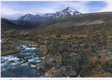
One of a number of mountain streams to cross

One never really sleeps well in a hut but we were still on the track, raincoats on, by 7.30am because we knew we had a pretty long day ahead, although the rain was over by 8.30am. The track varied from open alpine tussock to mountain beech stands with our morning tea stop overlooking the Waitonga Falls (39 m), highest falls in Tongariro National Park. One of us even spotted a whio flying off from a section of rapids and a North Island robin perched on a DOC sign awaited a photo. The next section was the least enjoyable - 3 km continuous up-hill on Ohakune Mountain Road to link up with the next section of Round the Mountain Track. We then wove down the steep track into the Makotuku valley, stopped for lunch amongst rocks and beside a little stream then crossed a lava ridge, seemingly barren, but upon close inspection, covered in clumps of alpine plants. In the afternoon we reached probably one of the highlights of our tramp - the Cascades in the expansive Mangaturuturu Valley. The rocks were coated with creamy silica and thousands of cubits of water rushed over them. We had to take great care how we crossed and at the bottom, gave each other a joyous and relieved "high five." In inclement weather, after heavy rain, this would be very dangerous and impassable. The little 10 bunk Mangaturuturu Hut, deep in the valley, was quaint, empty and had a memorial