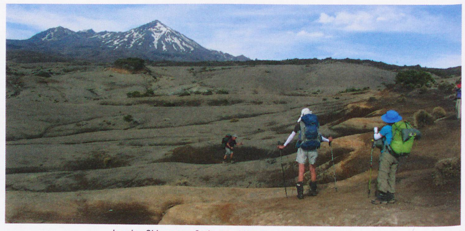
Leaving Ohinepongo Springs and heading into Rangipo desert

We awoke to mist floating below us and had breakfast on the deck watching a beautiful sunrise. Today's section was lots of climbing in and out of steep valleys. We took turns leading and watching out for the guiding poles, being thankful for good weather and visibility. The most interesting section was through the Waihianoa lahar gorge with the warning sign of "Extreme lahar risk next 400m. Do not stop in this area; do not proceed past here if you hear a loud roaring noise upriver." Then came the most challenging section with very steep down and uphill climbing requiring careful footwork on the unstable volcanic narrow tracks. Finally we dropped into the Karioi beech forest and through some tussock to the Maungaehuehu hut. Three huge sacks of firewood blocked our view of the mountain from the porch so a chaingang was set up and all the firewood stacked in nice neat Swiss rows. After cooling off in a near-by hidden water hole, other trampers arrived as this hut is only a 3 hour tramp from Ohakune Road. That evening, dark ominous clouds rolled in, the wind picked up and we were in for a stormy night but great to be tucked up in a hut, even if there were a couple of loud snorers!