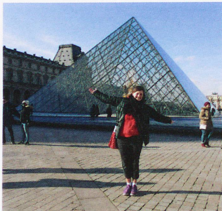
I spent the first part of my trip in Paris. I loved the culture, history, and gastronomy of the city (I ate so many crêpes...) Though most people spoke to me in English, this was my first time immersed in a primarily French-speaking environment.