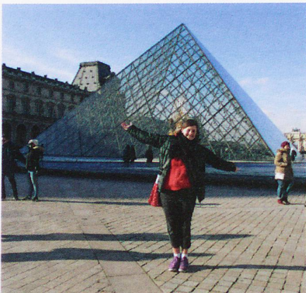
I spent the first part of my trip in Paris. I loved the culture, history, and gastronomy of the city (I ate so many crêpes...) Though most people spoke to me in English, this was my first time immersed in a primarily French-speaking environment.