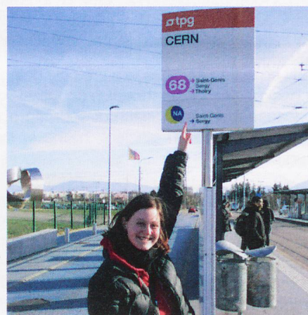
I am a student of physics so I was very excited to visit the CERN laboratory in Geneva. Unfortunately, it was closed, but I was still in awe of being so close!