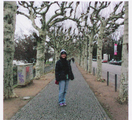
There are so many countries on your doorstep when you live in Switzerland. I boarded a train bound to Frankfurt to visit a friend, and three hours later I was in another country! This was a completely new concept to me.