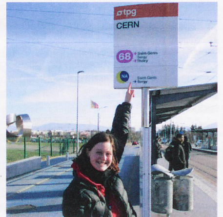
I am a student of physics so I was very excited to visit the CERN laboratory in Geneva. Unfortunately, it was closed, but I was still in awe of being so close!