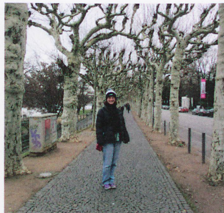
There are so many countries on your doorstep when you live in Switzerland. I boarded a train bound to Frankfurt to visit a friend, and three hours later I was in another country! This was a completely new concept to me.