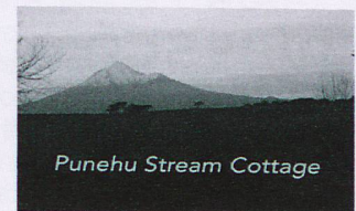
Punehu Stream Cottage

As you arrive, please support the Swiss Pro Patria Foundation by purchasing an emblem (Abzeichen) - all funds raised will go towards the maintenance and upkeep of many heritage projects in Switzerland.